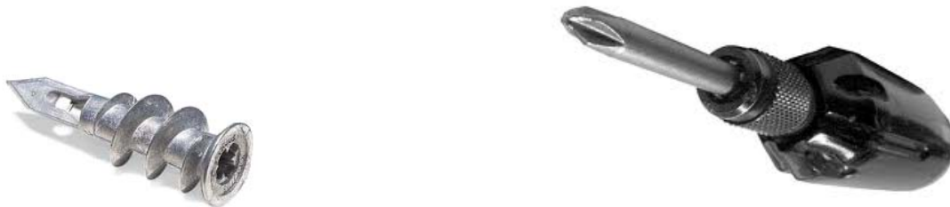
E-Z Ancor™ and Phillips Screwdriver

Use a Phillips screwdriver to insert an E-Z Ancor™ at each marked location on the wall by gently pushing and turning in a clockwise direction. Be sure after tightening, that the surface of the E-Z Ancor™ is flush with the wall.